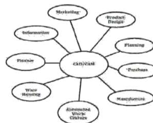
Fig. 3: CAD/CAM Database

is being additional wide employed to verify and improve designs, fast tooling additionally as initial prototypes.