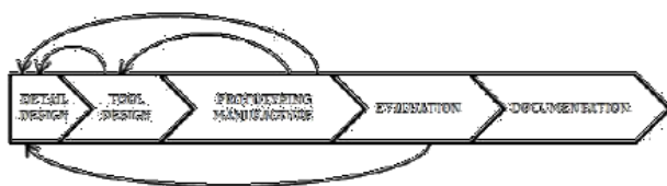
Fig. 2: Prototyping Stage of Product Development